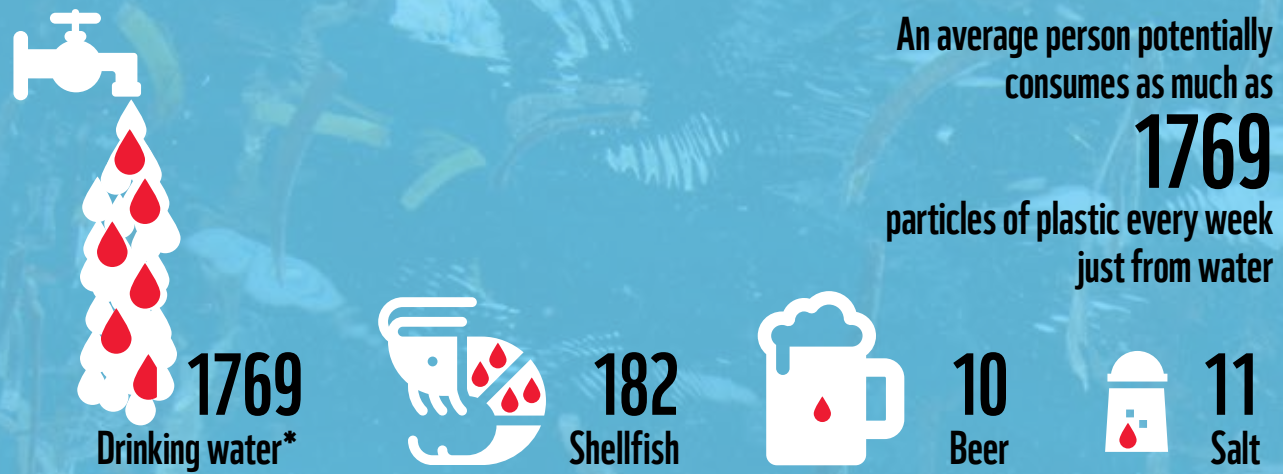
Figure 2: Estimated microplastics ingested through consumption of common foods and beverages (particles (0-1mm) per week)

* Drinking water includes both tap and bottled water