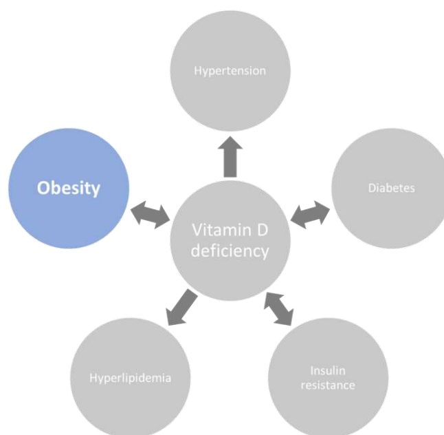
Figure 1. Vitamin D deficiency is strongly related to obesity as well as to other components of adiposity-related dysmetabolic state.

Low VD is also associated with poor health behaviors. Recently, its deficiency has been associated with a large number of disorders such as metabolic syndrome, cancers, and autoimmune, psychiatric, and neurodegenerative diseases, but the causative role of VD deficiency in many of these conditions remains unclear [7]. Since VD deficiency is related to visceral adiposity; it could be used as a biomarker of a visceral adiposity-related dysmetabolic state (cardiovascular diseases, type 2 diabetes, dyslipidemia, arterial hypertension) (Figure 1). Nevertheless, its independent role in the development and progression of these diseases cannot yet be excluded, due to changes in the expression of genes regulated with VD receptors. Moreover, as stated below, in VD deficient subjects, the lack of possible anti-inflammatory effects on chronic low-grade inflammation could lead to an enhanced risk of obesity-related metabolic disorders.