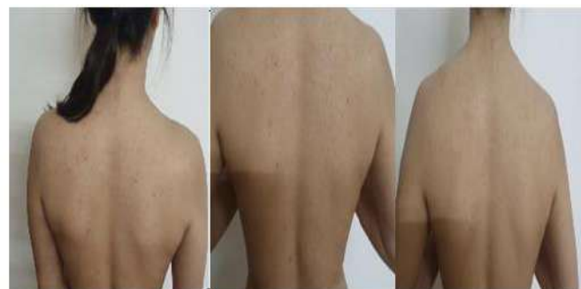
Figure 1. Dorsal region presentation after the application of vitamin D cream (stage of reduction 100%)